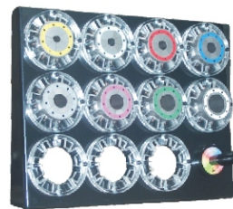
CS32EQCR Quick Change Rack