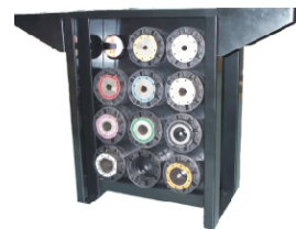
CS50EQCS Quick Change Stand