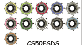
CS50ESDS Standard Die Set