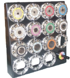
CS50EQCR Quick Change Rack