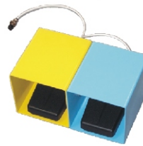
CSFP Foot Pedal Control