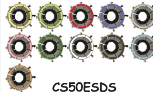
CS50ESDS Standard Die Set